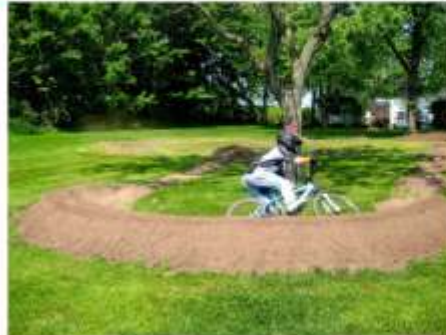
An example of an earth-formed pump track in park land

It may be necessary to move some of the recently planted trees to get access to the site, but they will be replanted nearby.