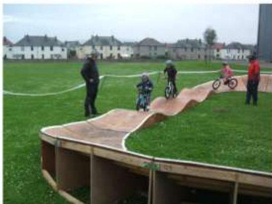
Children enjoying the temporary wooden pump track at Dunbar Grammar School, June 2012